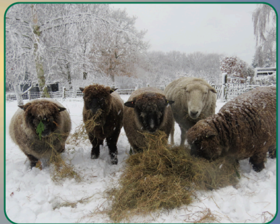
Winter in the Countryside