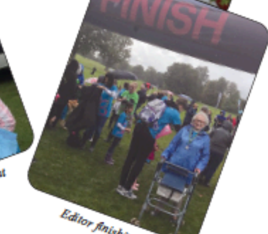
Editor finishing the walk