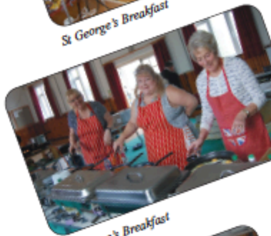
St George's Breakfast