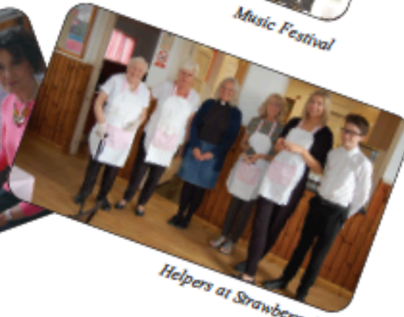
Helpers at Strawberry Tea