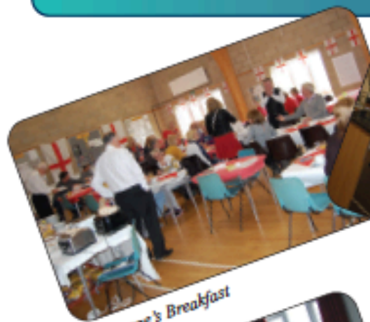
St George's Breakfast