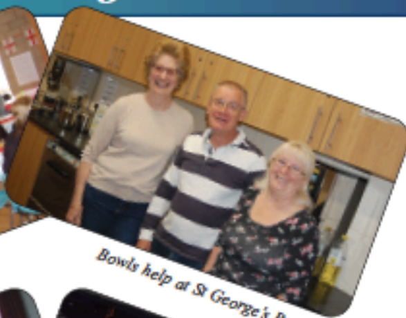
Bowls help at St George's Breakfast