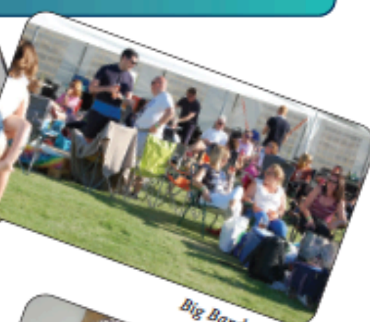
Big Band Concert