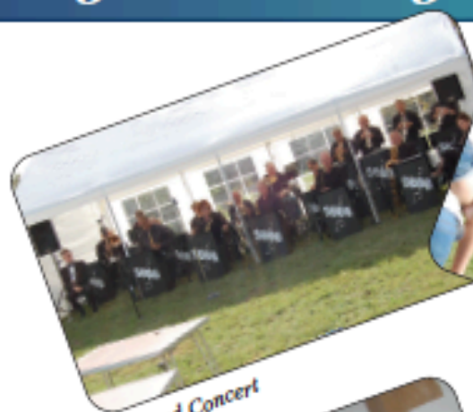
Big Band Concert