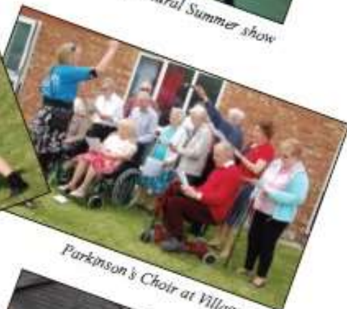
Parkinson's Choir at Village Fete