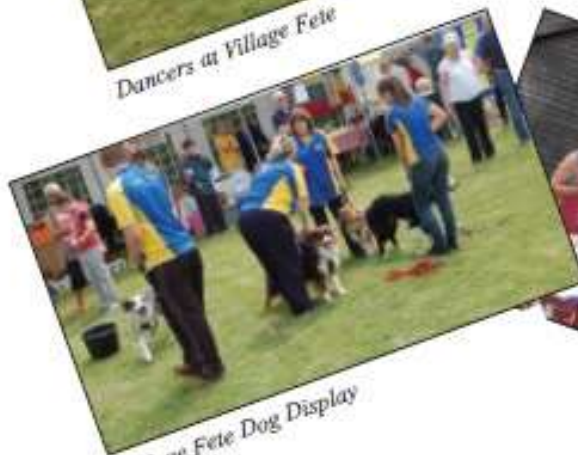
Village Fete Dog Display