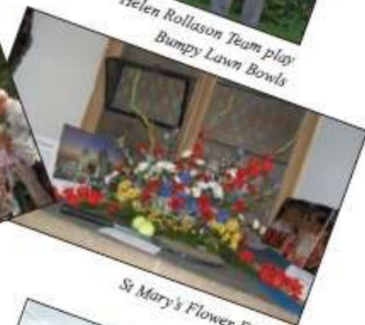
St Mary's Flower Festival