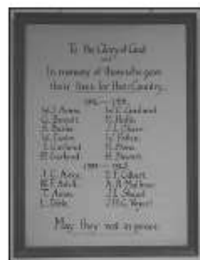
Memorial in St Mary's Church to those who lost their lives in two World Wars