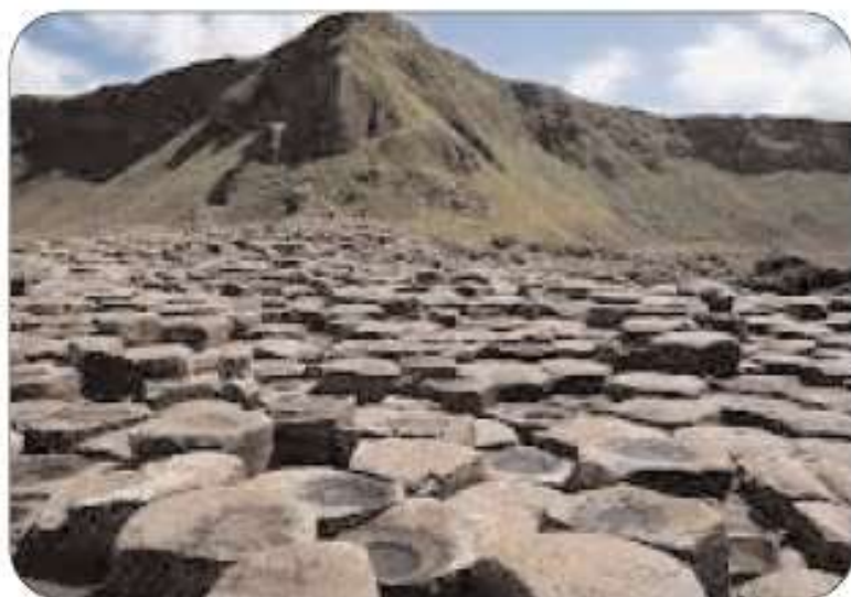
Giants Causeway, Ireland