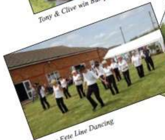
Village Fete Line Dancing