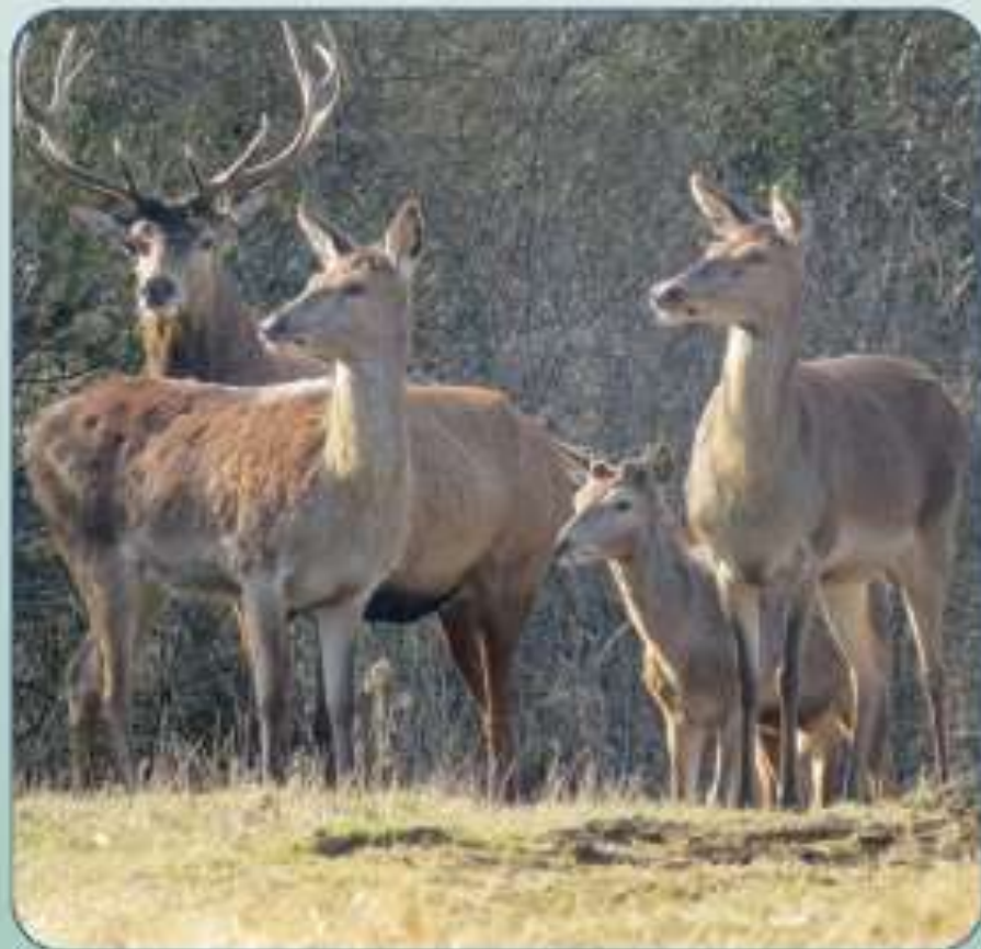
Red Deer near Hanningfield Reservoir