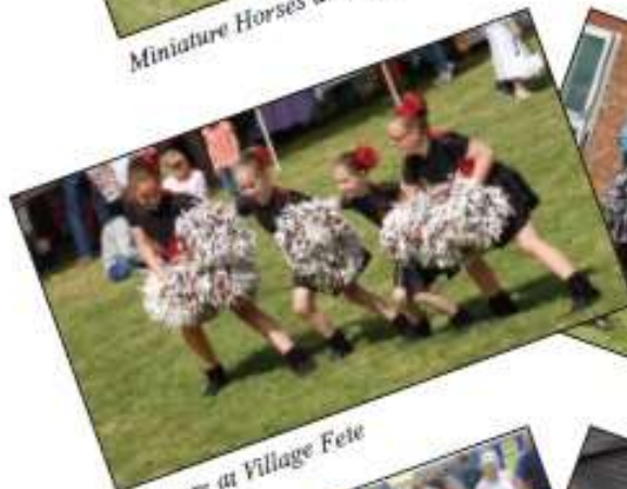
Dancers at Village Fete