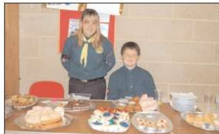
Scouts and Cubs help at the Village Fete