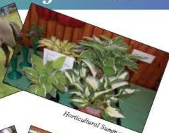
Horticultural Summer show