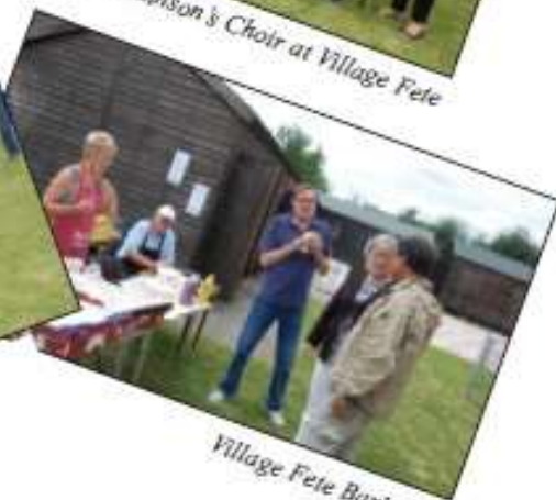
Village Fete Barbeque