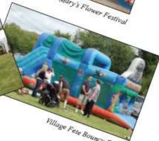
Village Fete Bouncy Castle