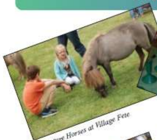
Miniature Horses at Village Fete