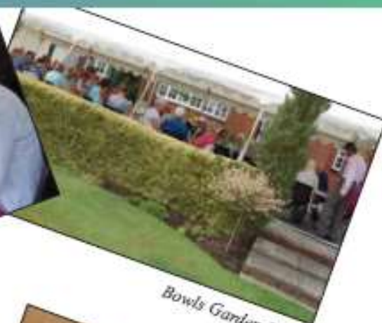
Bowls Garden Party