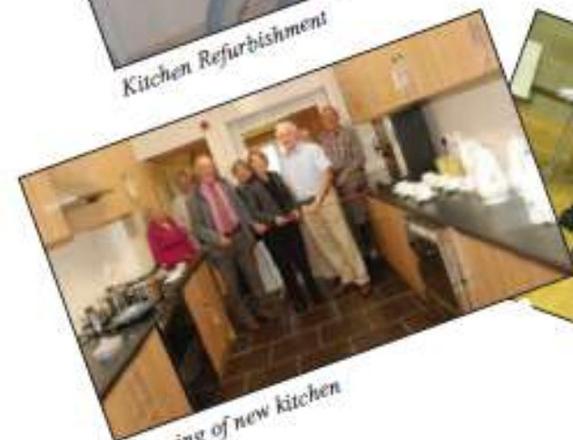
Opening of new kitchen