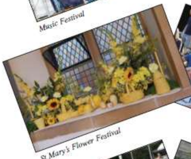
St Mary's Flower Festival