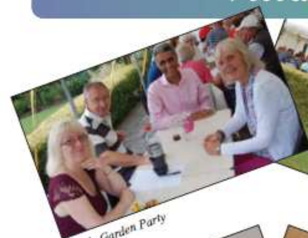
Bowls Garden Party