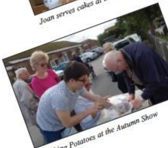
Weighing Potatoes at the Autumn Show