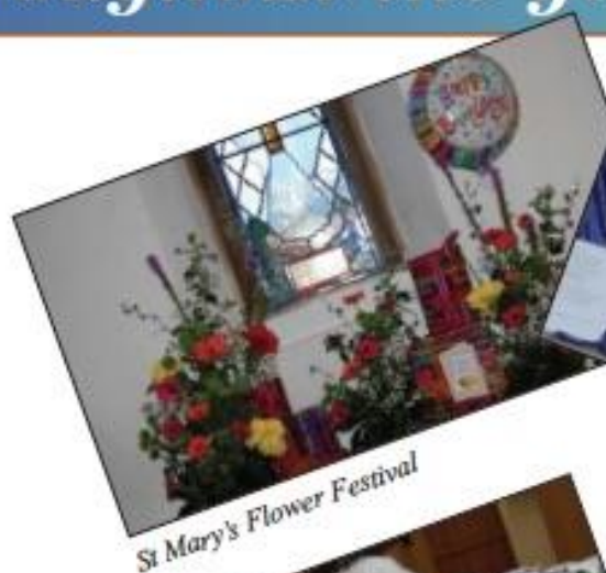
St Mary's Flower Festival