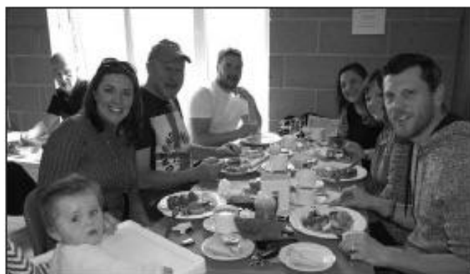
St George's Breakfast