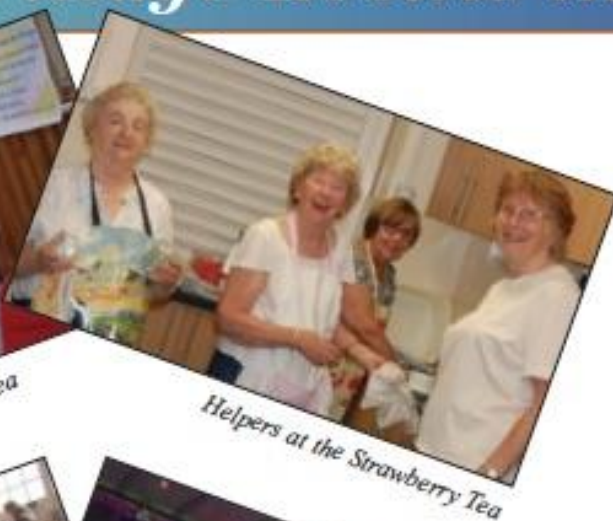
Helpers at the Strawberry Tea