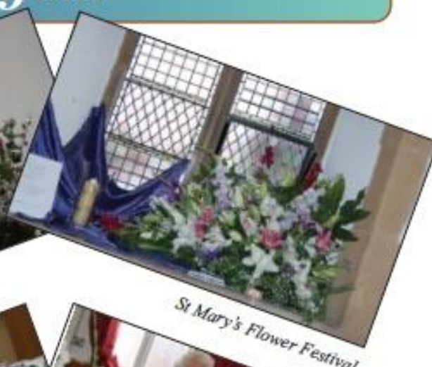
St Mary's Flower Festival