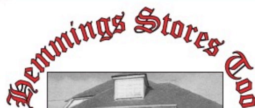
Church Road Ramsden Bellhouse

63A DOWNHAM ROAD, RAMSDEN HEATH, CM11 1PZ