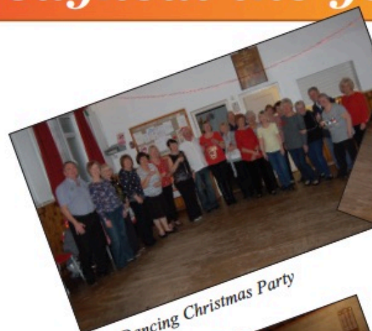
Line Dancing Christmas Party