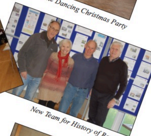
New Team for History of Ramsden