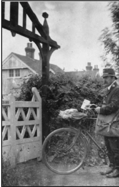
Post man delivering the mail in Ramsden Bellhouse Pre 1919