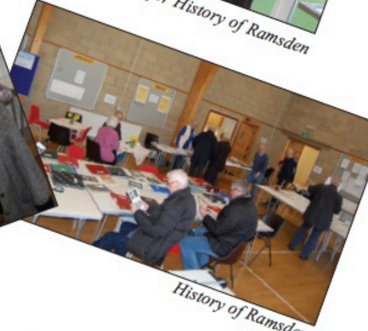
History of Ramsden