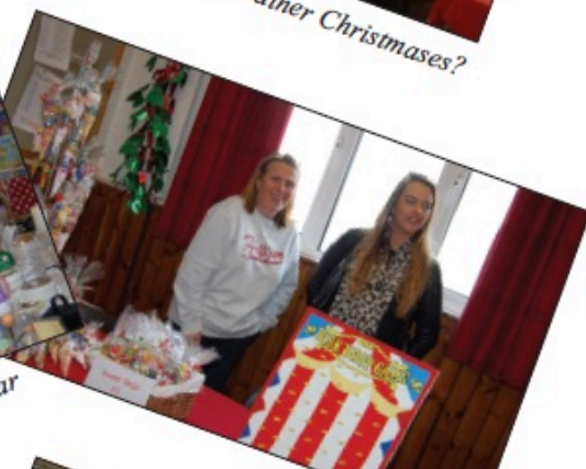
Pre School stall