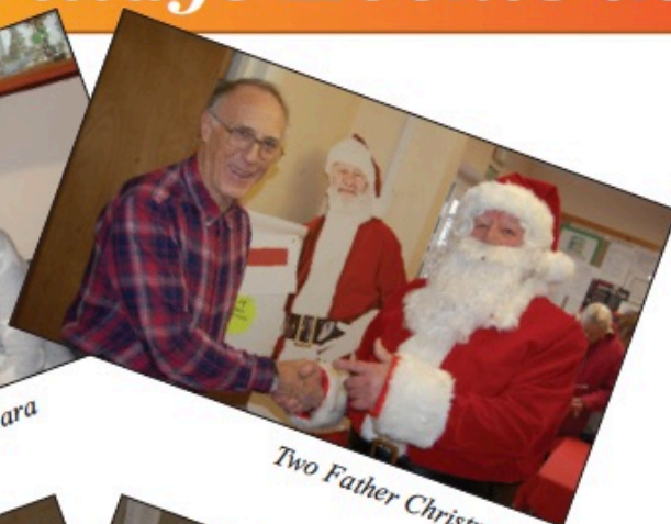
Two Father Christmases?