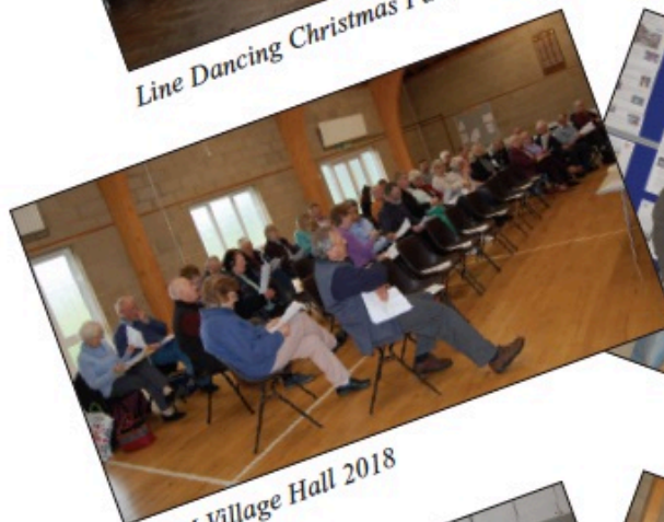
AGM Village Hall 2018