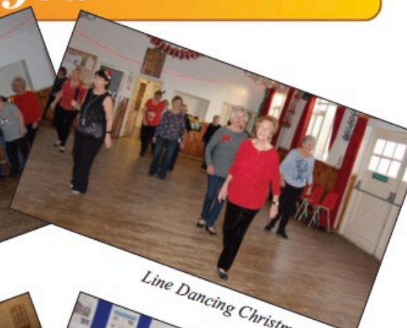
Line Dancing Christmas Party