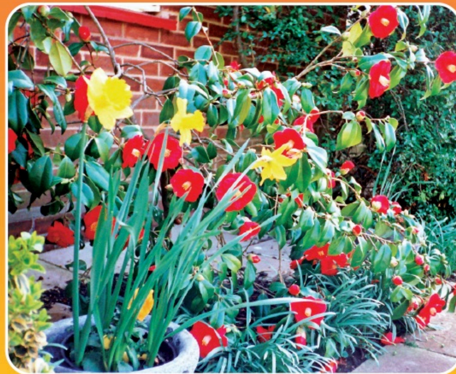
Ramsden Bellhouse garden in the Spring