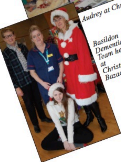
Basildon Dementia Team help at Christmas Bazaar