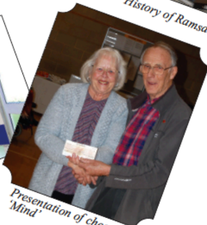
Presentation of cheque to 'Mind'