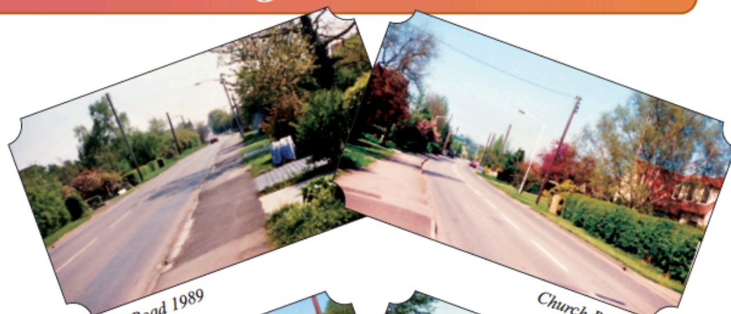
Church Road 1989