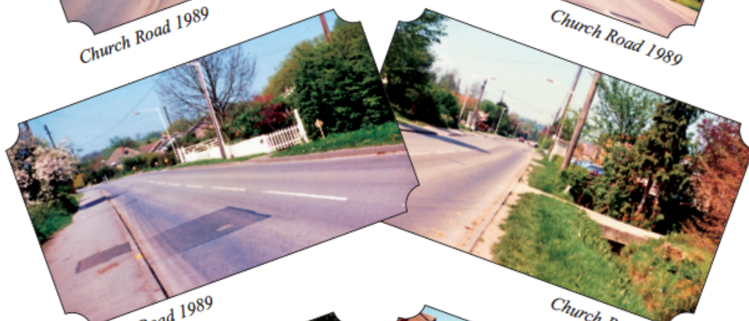
Church Road 1989