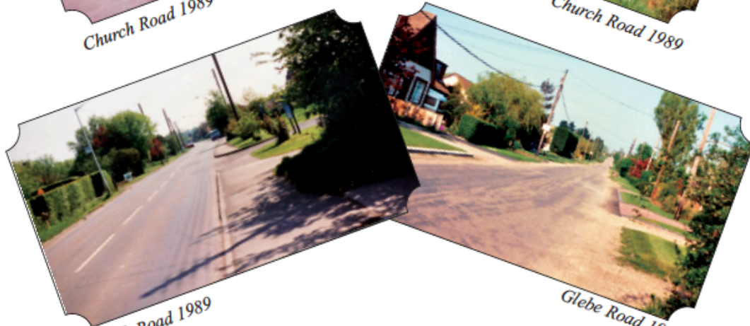
Church Road 1989